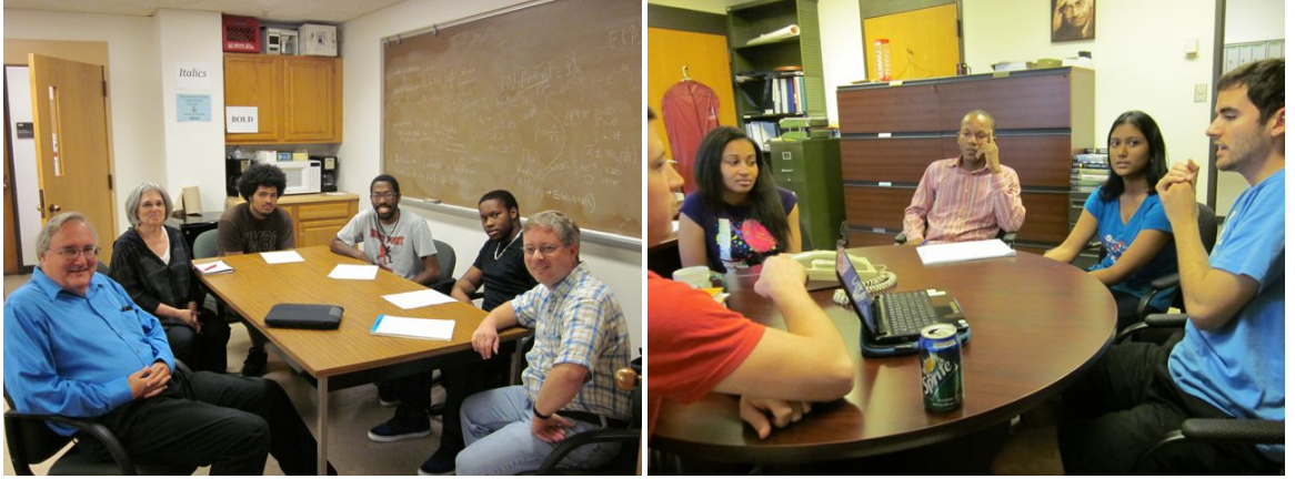
Figure 3: 2011 Team 4 meeting with client.

In order to continue to have some structure in the program and for the overall cohort to continue to gel, we continue with morning meetings for the whole group on a range of subjects that either prepare for Phase III or that deal with vital aspects of professional development, see Higham (1998) for ideas how to present these. Examples of the former include a discussion of structure of typical journal papers, the submission/review process of publications, and LaTeX as tool for making effective visual aids for oral presentations and for poster presentations. Examples of the latter include issues of professional integrity in the sciences, proper use of references, and intellectual property and copyright issues. During a few of the morning meetings at 9:00 a.m. during this phase, we welcome VIP visitors to our program, such as University President, Provost,