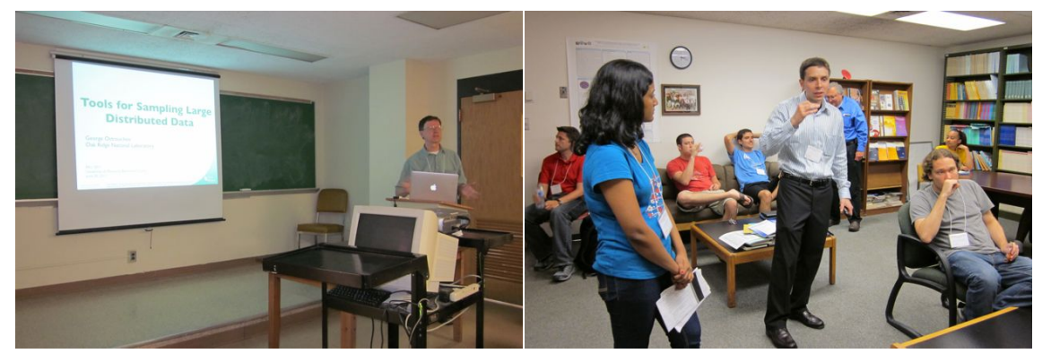
Figure 1: Client presenting potential project.

During the afternoons of Thursdays of Weeks 1 and 2 starts the research component of the program. The client scientists from areas outside of mathematics and statistics spend the afternoon and evening in the program, formally presenting their problem in a 30-minute talk including questions (Figure 1) and discussion and informally being available in the breaks (Figure 2) and over dinner. The teams have ample opportunity to make contact with these clients and